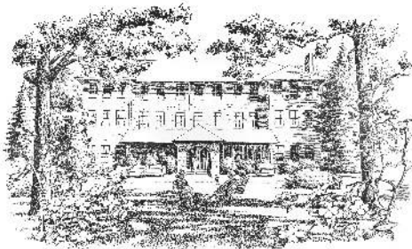
ORIGINAL SKETCH OF THE MONTE VISTA BY WALTER S. DOUGHERTY